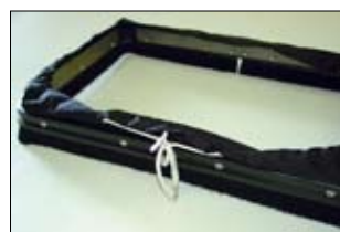
Dust Skirt Assembly For OBS 18DC PN 18455A