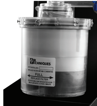
Acadia Clear Filter