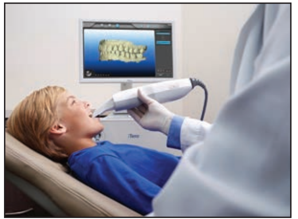
Fig. 1 iTero intraoral digital scanner in use.

tual setups, and indirect-bonding trays. A patient's stone models or PVS impressions were mailed to the OrthoCAD scanning center, where they were processed into a digital file that was downloaded to the doctor's office network. In 2006, Cadent developed the in-office iTero* digital impression system, which by 2008 was capable of full-arch intraoral scanning (Fig. 1); in late 2009, Cadent launched the iOC* system for iTero users. Align Technology purchased Cadent in 2011, allowing clinicians with iOC to begin submitting 3D digital scans in place of physical impressions for the fabrication of Invisalign appliances.