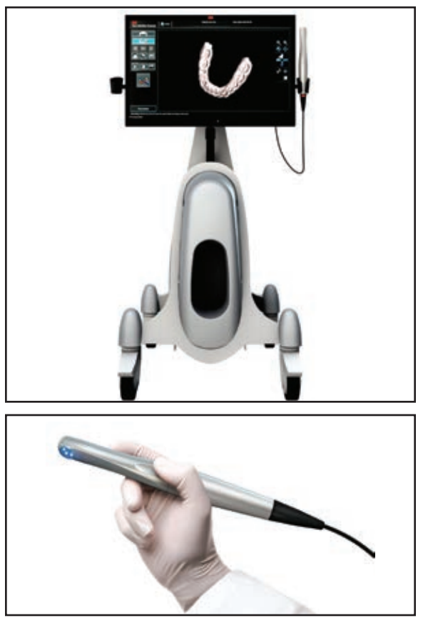
Fig. 6 True Definition intraoral scanner with touchscreen monitor and lightweight wand; 3D in-motion video technology enables rapid video scanning in real time.

cleaned with sterile wipes and placed in a coldsterile solution after each use, it is helpful to purchase a second wand. Six LEDs on the tip illuminate the field, and the wand is easy to rotate, allowing the operator to scan at all angles with a minimum of movement.