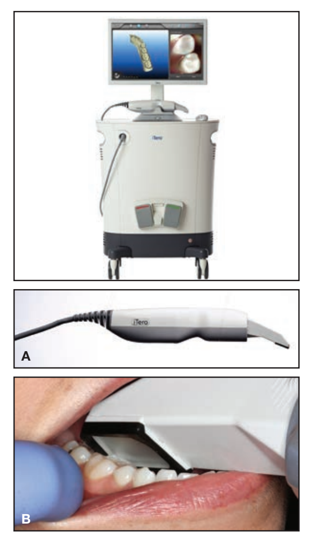
Fig. 5 A. iTero intraoral scanner with sealed keyboard, wireless mouse, and wireless foot pedal; parallel confocal imaging enables powder-free scanning. B. Wand held at 45° to capture both lingual and occlusal surfaces.

lingual side (Fig. 5B), beginning with the lower left lingual quadrant. Although a full-mouth scan and bite registration takes 10-15 minutes, Align has indicated that this time will be reduced in the near future.