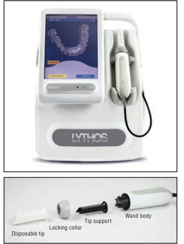
Fig. 7 Lythos intraoral scanner featuring compact design and touchscreen monitor with extension arm; accordion fringe interferometry enables powder-free scanning at video speed.

scan is divided into quadrants, beginning on the buccal side of the lower right terminal molar. The wand is swept mesially, quickly capturing multiple teeth in real time. After three or more teeth are scanned, the operator should pause briefly to allow the data to process. The wand is then rotated to capture the lingual surfaces. A full-mouth scan takes about seven minutes.