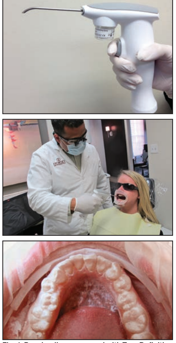
Fig. 4 Powder dispenser used with True Definition scanner.

Since no optically based digital impression system can scan through tissue or saliva, proper retraction and isolation are essential for accurate capture of surface data.<sup>6</sup> Full-arch scanning may require the use of retractors, dri-angles, saliva ejectors, and even a second coating of powder if saliva washes the powder off some surfaces.