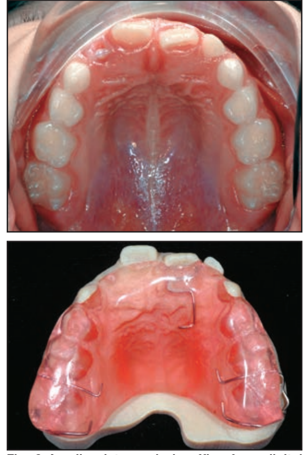
Fig. 8 Acrylic plate made in office from digital scanner-generated STL file and 3D-printed model.

Cone-beam computed tomography (CBCT) and digital imaging and communications in medicine (DICOM) files can now be merged with STL