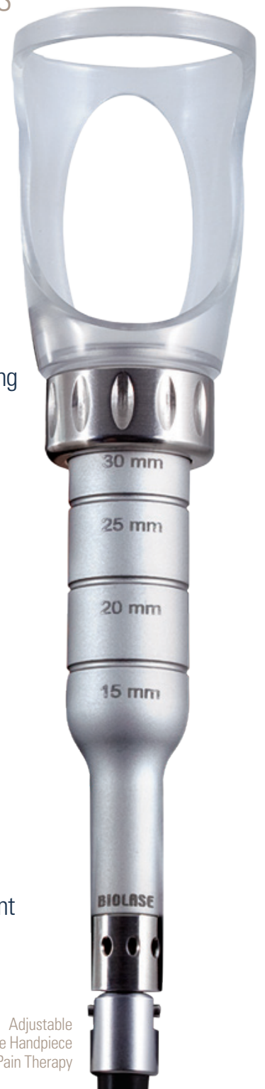
Adjustable Deep Tissue Handpiece for Pain Therapy

Epic T-Series' proprietary Deep Tissue Handpiece (DTHP) is able to control important parameters such as spot size and power intensity to ensure an equal diffusion of energy over the entire treatment area for optimal results.