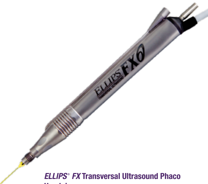
ELLIPS® FX Transversal Ultrasound Phaco Handpiece Part # 690880