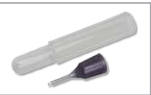
Multi-use 20-gauge, Laminar® High Flow Irrigation Sleeve and Test Chamber Part # OPOHF20L