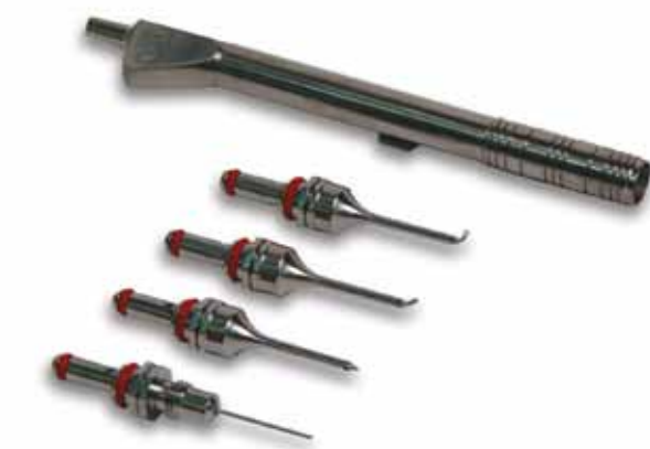
Silicone-coated Soft Irrigation and Aspiration