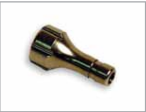
Metal Tip Wrench Part # OPOMTWL