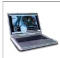
WHITESTAR Signature® Surgical Media Center Part # SMC001