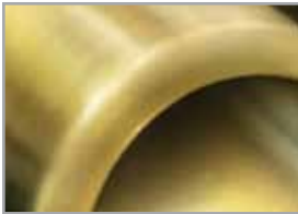
Dewey Radius® phaco tips have radiused edges.