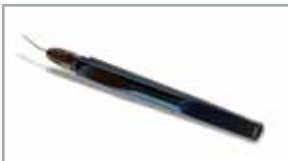
Microcapsulorhexis Forceps Part # DF0002