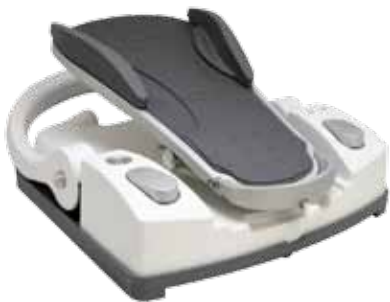
WHITESTAR Signature® System Advanced Control Footpedal Part # NGP680702

All of the innovative features of the WHITESTAR Signature® System can be quickly accessed via the new easy-to-use Advanced Control Foot Pedal, delivering customizable switching capabilities for all system functions with smooth up-down and left-right positioning.