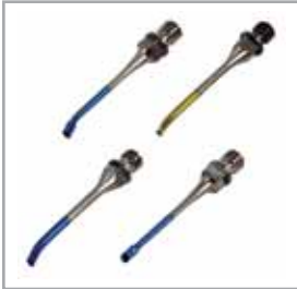
MST Phaco Tip – 20-gauge, 45-degree, bent Part # PT-27245