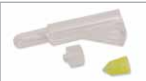
Single-use Bimanual Kit Part # OPOBKD20L