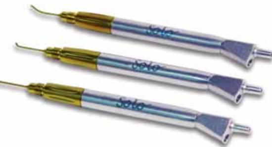
Solo Irrigation and Aspiration Kit Part # OPOIA20KIT