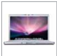
WHITESTAR Signature® Surgical Media Center Apple Laptop Part # SMC002-MBPRO