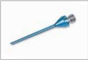
Laminar® Flow Phaco Tip – 21-gauge, 45-degree, round Part # OPOR4521G