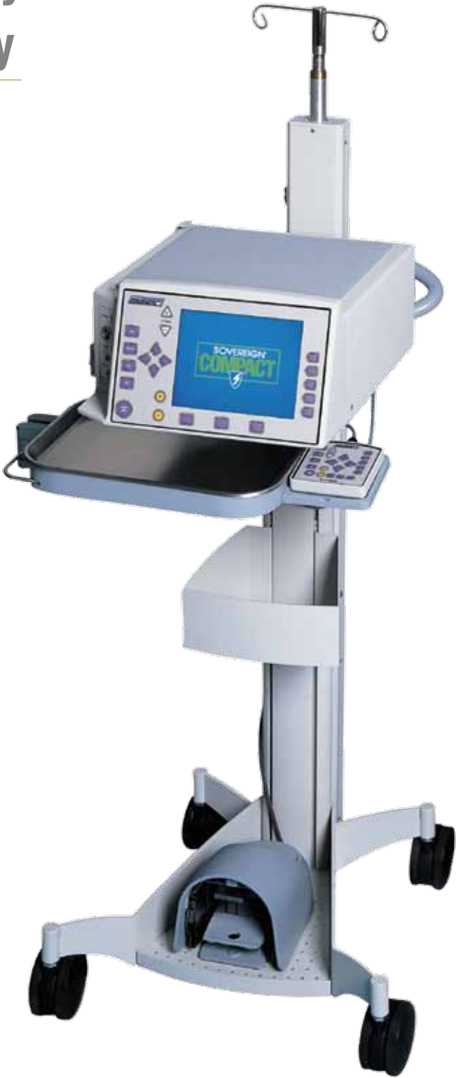
SOVEREIGN® Compact System Console Part # CMP680300 SOVEREIGN® Compact System Cart Part # CMP680002