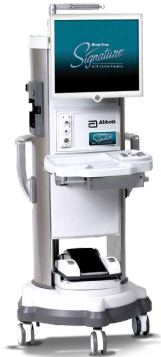
WHITESTAR Signature® System Console Part # NGP680300

The unique ELLIPS® FX Transversal Ultrasound technology offers smooth and efficient cutting through a simultaneous blending of micropulsed longitudinal and transversal modes to accommodate a wide range of surgical techniques.