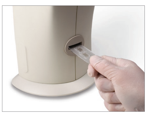
Fig. 2. Inserting the slide into the TC10 cell counter; counting automatically begins.