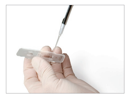
Fig. 1. Loading the sample onto a slide.

Press Home and completely insert the slide into the slide slot (Figure 2). If the slide is not completely inserted, the instrument does not detect the slide and counting does not start.