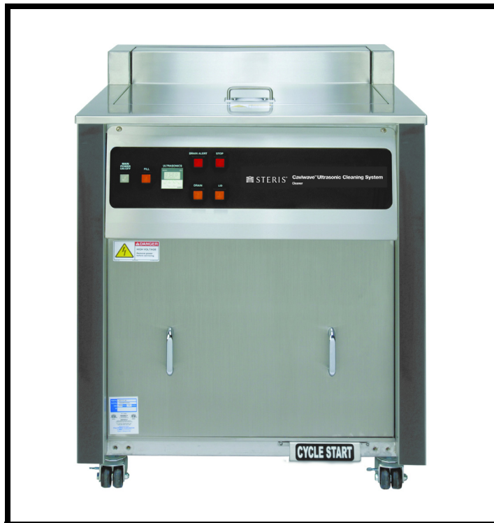
(Typical only - some details may vary.)

The Sonic Cleaner is equipped with an automatic opening lid and load elevator for easy and safe instrument loading.