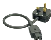
EXTL100-02 (UK plug)