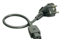
EXTL100-02 (Schuko plug)