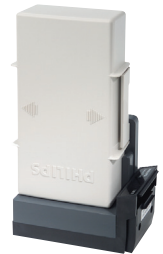
Custom battery adapters for commonly used batteries

Philips offers the Cadex C7000-Series battery analyzers as support systems for the batteries of its HeartStart ALS monitor/defibrillators. The simple-to-operate Cadex C7200 and C7400 analyzers provide an effective and economical battery management solution.