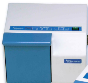
Stomacher® 80 Biomaster