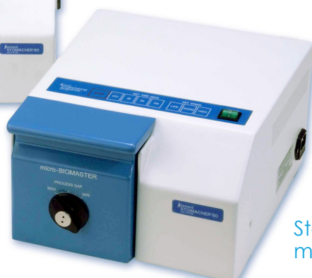
Stomacher® 80 microBiomaster