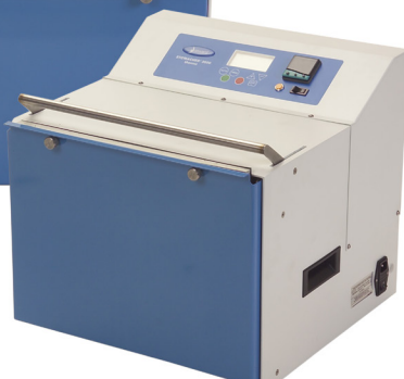
Stomacher® 3500 Thermo Bioreactor