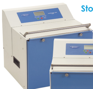
Stomacher® 3500 Standard

3 year warranty and 10 year service support