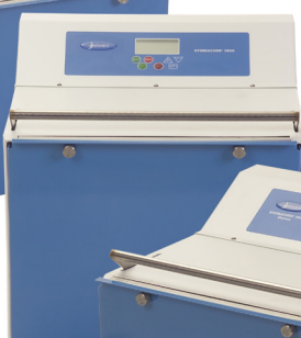
Stomacher® 3500 Water Biowasher