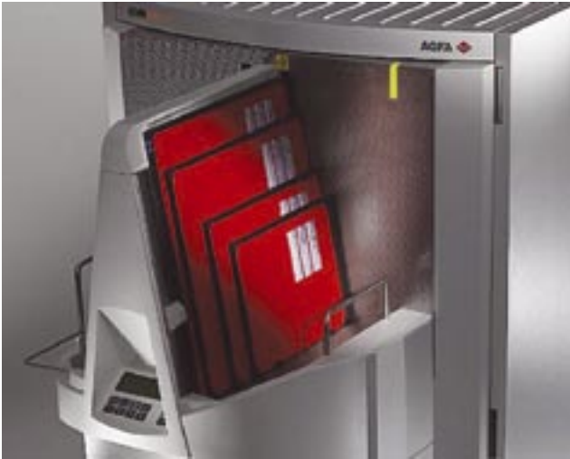
Integrated CR user station for time-saving identification and optimized workflow