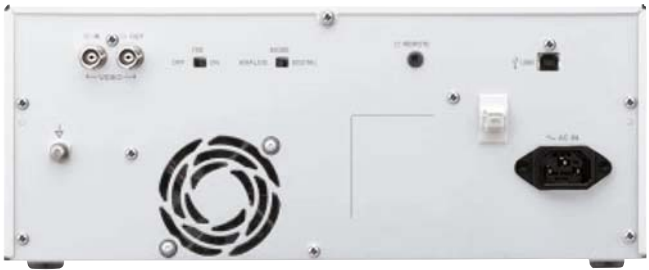
UP-990AD Rear Panel