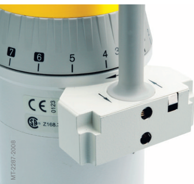
Auto Exclusion plug-in adapter