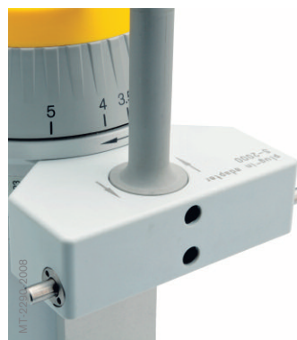
Plug-in S-2000 adapter with Interlock S