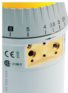
Permanent connection with the appropriate connector options (not shown)