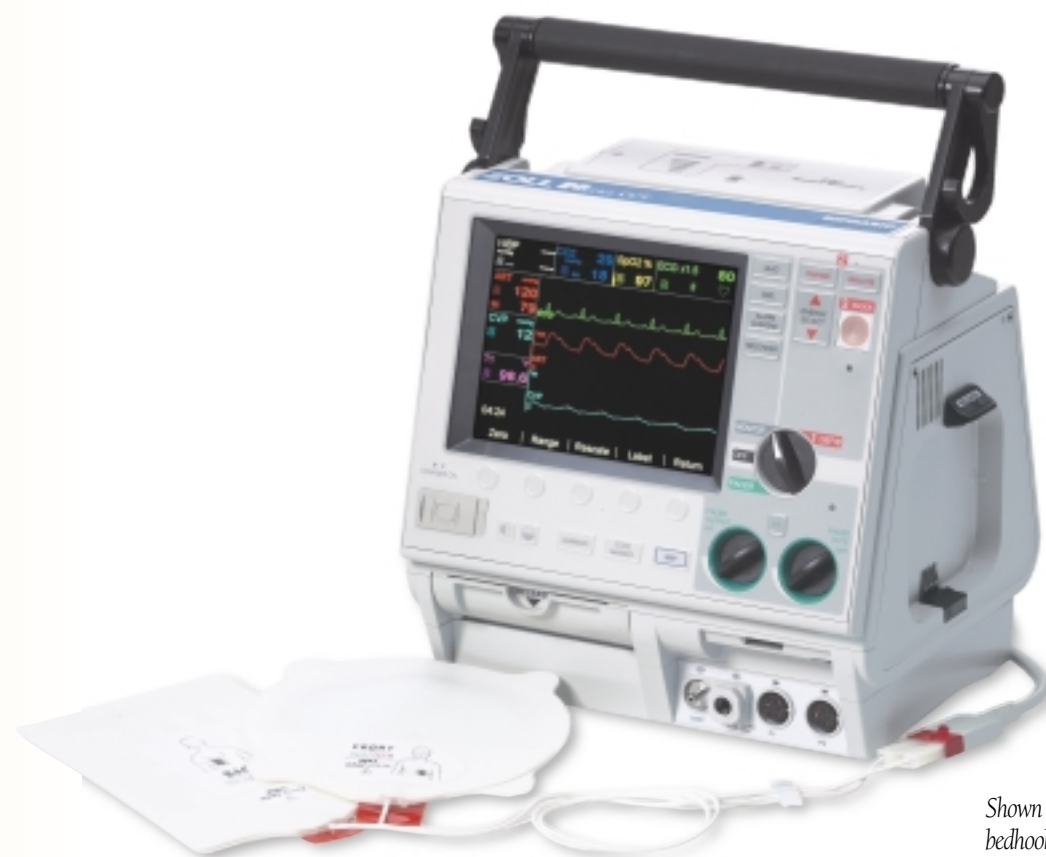
Shown with optional bedhook accessory.

The M Series CCT is the newest member of the ZOLL family of familiar, easy-to-operate defibrillators. With its straightforward controls and ZOLL Uniform Operating System, the M Series CCT reduces staff training and minimizes operator confusion. It is the perfect combination for critical care transport and advanced life support.