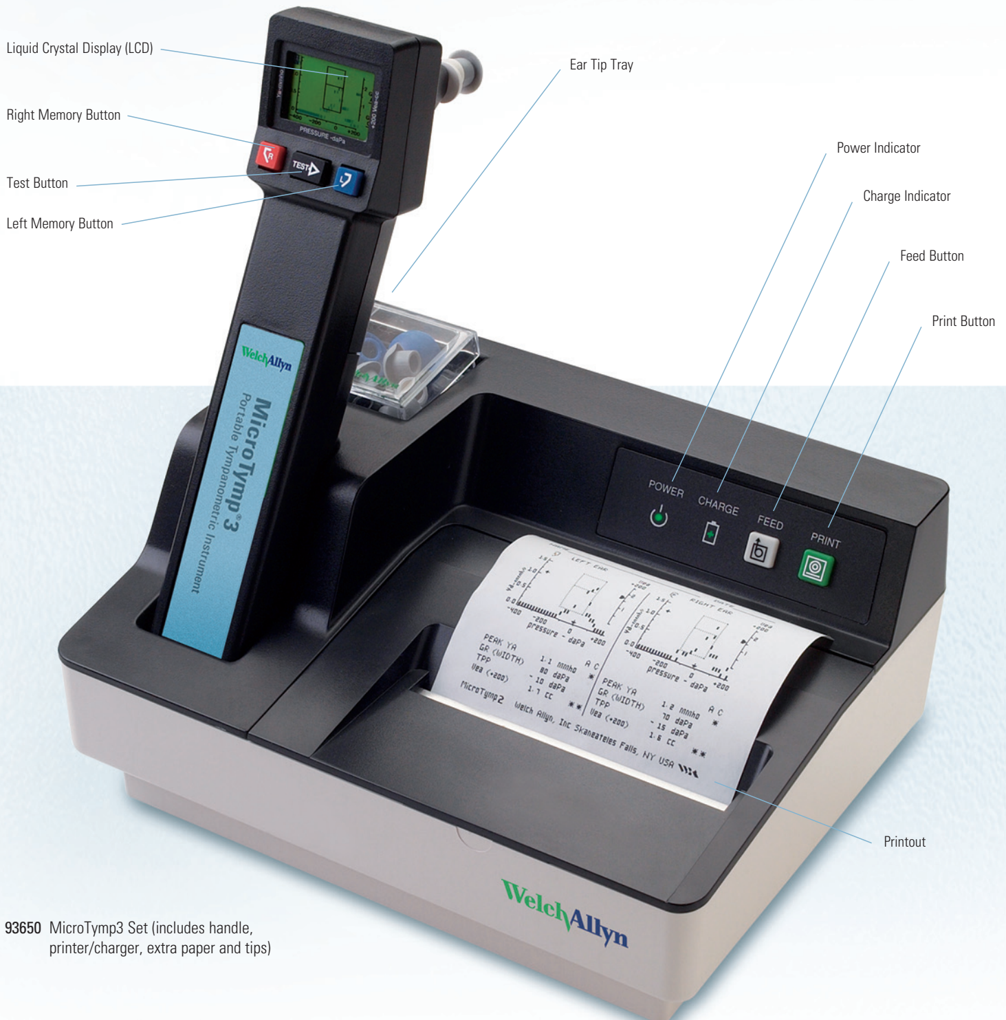
93650 MicroTym3 Set (includes handle, printer/charger, extra paper and tips)