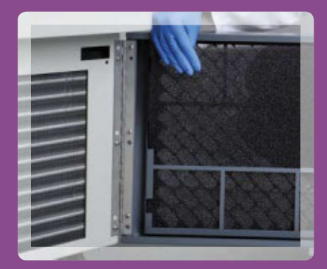
Easy-to-remove air filter

including microprocessor control and monitoring system, ensures that all controls and displays are easy to reach and read. Eye level on our -86°C freezers or knee level on the -40°C freezers.