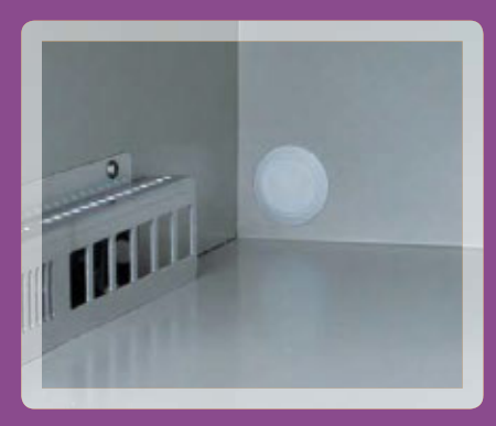
Two 1" (25mm) access ports