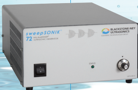
sweepSONIK 3 72 kHz