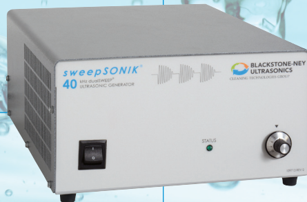
sweepSONIK 3 40 kHz