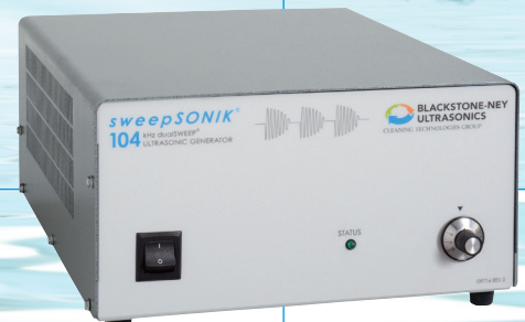
sweepSONIK 3 104 kHz