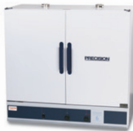
Top and bottom: Precision Model 6