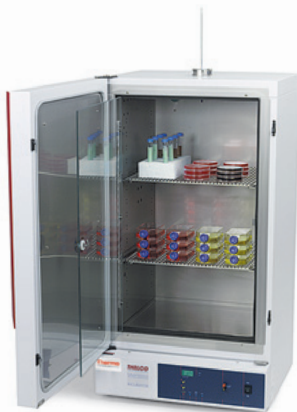
Precision Thelco 6DM Incubator with optional thermometer

Thelco Incubators are designed to provide the precise temperature control and uniformity required for the most demanding incubation applications. These versatile microprocessor controlled incubators feature push-button temperature setpoint selection, an easy-to-read digital display, and built-in over-temperature protection. Equally important, the specially balanced heat convection patterns combine to provide chamber uniformity as precise as \pm 0.25^{\circ}\text{C} .