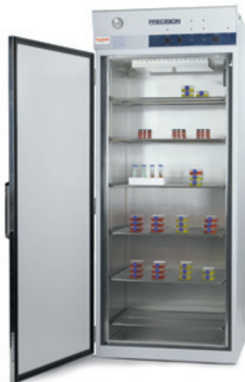
Precision 30M Incubator

2. Unit is shipped on its back in a wooden crate.