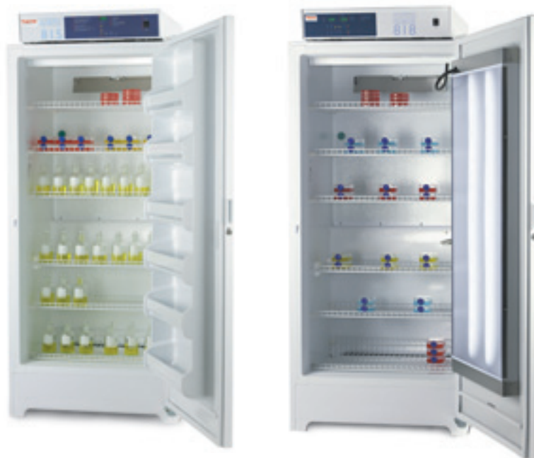
Precision Refrigerated Incubator Model 815 (left) and Model 818 (right)