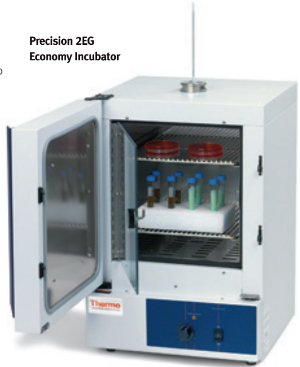
Precision 2EG Economy Incubator

Precision Economy Incubators are available in five different models. Choose mechanical or gravity convection; capacities of 1.4 cu. ft. (40 liters), 2.5 cu. Ft. (71.5 liters), or 4.5 cu. ft. (129 liters). All feature corrosion-resistant stainless steel interiors; easy-clean, non-tip shelving; and tough powder coated exteriors.