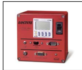
Control Timer 960356