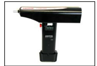
Pistol Grip Timer 1003327