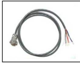
PLC Interface Cable 8900550