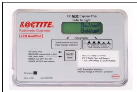
UV - V Dosimeter 1265282