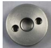
Dosimeter Tip Adapter 1403405