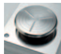
Levelmatic centering device to eliminate corner load error