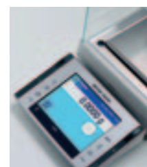
SmartScreen for easy and efficient operation