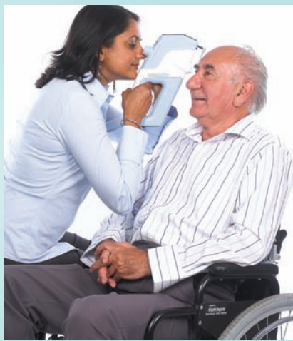
For additional stability and to ensure the perfect conditions are met every time use the new 'pop out' forehead stabiliser