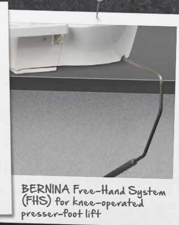
BERNINA Free-Hand System (FHS) for knee-operated presser-foot lift