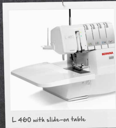
L 460 with slide-on table

The well-lit grand workspace of this overlocker eases sewing as well as threading of loopers and needles. Thanks to the Free-Hand System (FHS) that raises and lowers the presser foot both hands are free for sewing and placing the fabric. The slide-on table expands the work space to support larger sewing projects.