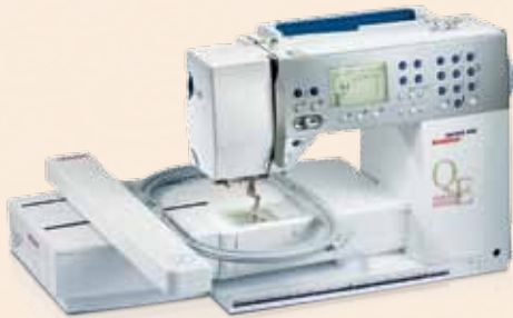
aurora 440QE (with embroidery module)