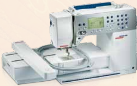
aurora 450 (with embroidery module)