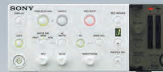
PMW-10MD Front Panel