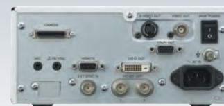
PMW-10MD Rear Panel