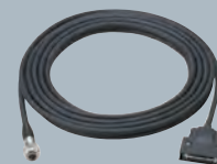
Camera Cables: CCMC-T05, CCMC-T10, CCMC-T15, CCMC-T20