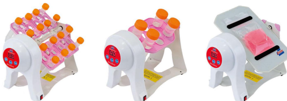
Tube Revolver with Variable Speed and Digital Display TR-02UA (Previous Model HYQ-1131A)