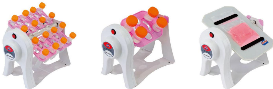
Tube Revolver with Fixed Speed TR-01A (Previous Model HYQ-1130A)