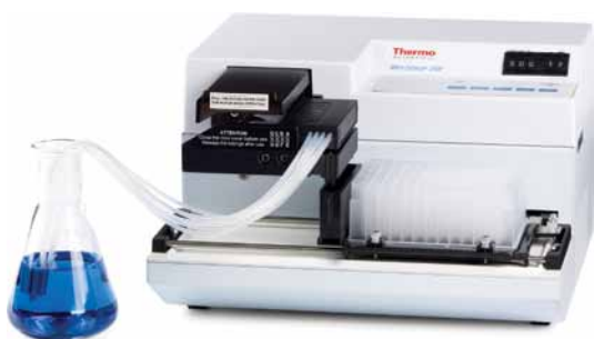
Thermo Scientific Multidrop DW