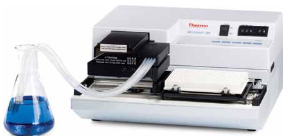
Thermo Scientific Multidrop 384