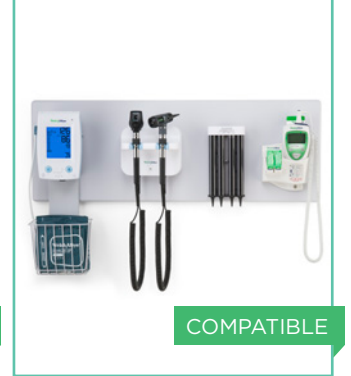
Integrated Wall System Compatible with the Welch Allyn Integrated Wall System to put key instruments at your fingertips.

Wall Mount Bracket Ensures the device is exactly where you need it when you need it. Includes cuff storage basket.