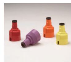
Agent color coded Easy-fill bottle adapters