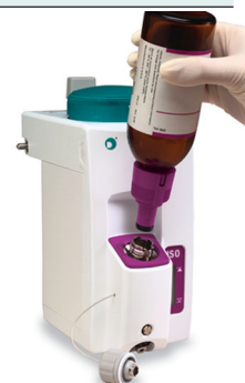
Easy-fill helps simplify agent filling