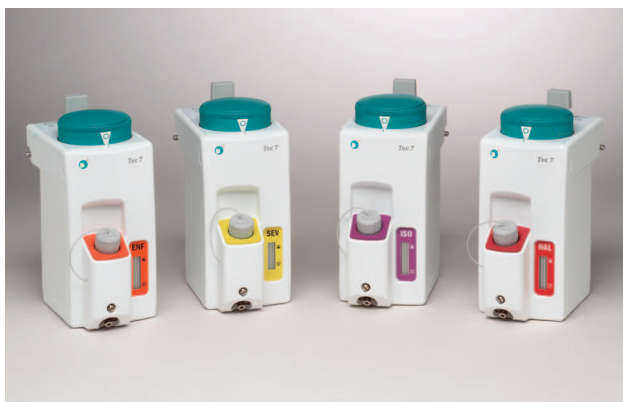
Tec 7 agent specific vaporizers