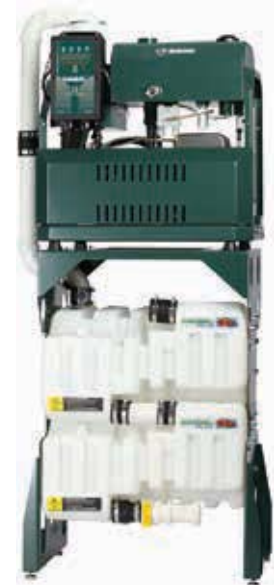
Bison stacked over 30 gallon Otter Tank using optional platform