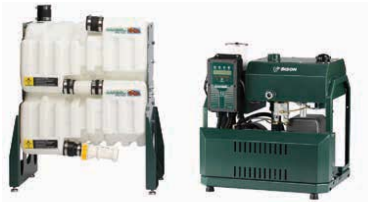
Bison beside 30 gallon Otter Tank