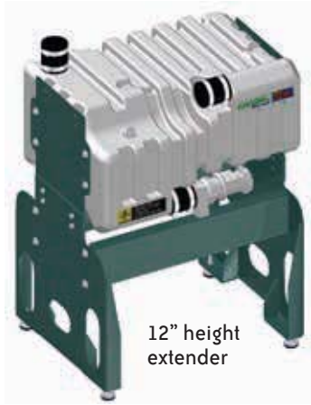
12" height extender