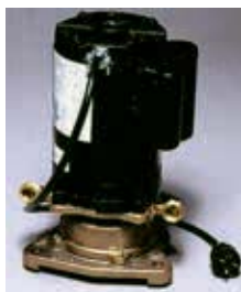
OLD STYLE NO RELAY BOX

For use with wet pumps with serial numbers starting with "V"