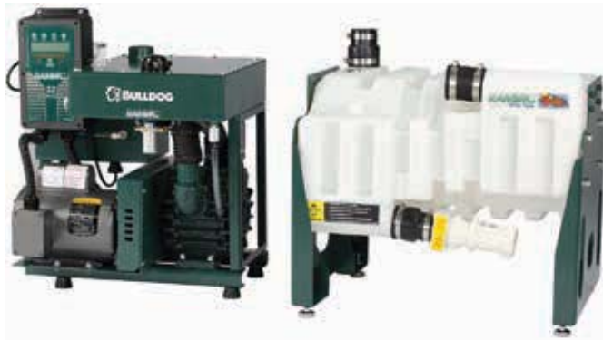
Bulldog beside 15 gallon Otter Tank