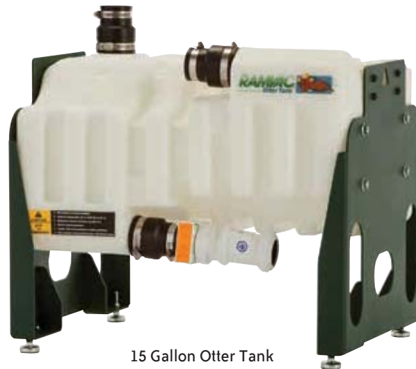
15 Gallon Otter Tank

Start your tank selection using the table below.