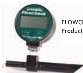
FLOWCHECK Product No. 800501