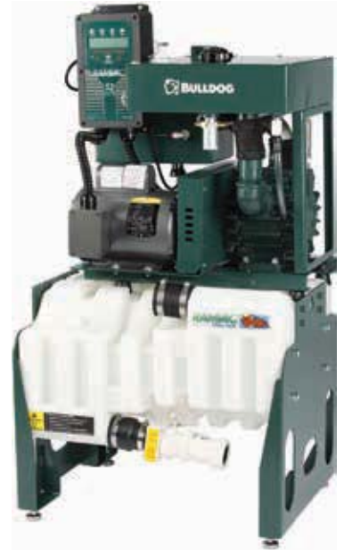
Bulldog stacked on 15 gallon Otter Tank