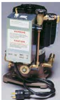
NEW STYLE WITH RELAY BOX

Replacement pumps are for out-of-warranty Dual Vacuum Systems ONLY.