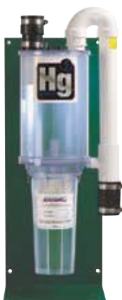
Hg5 with cartridge attached