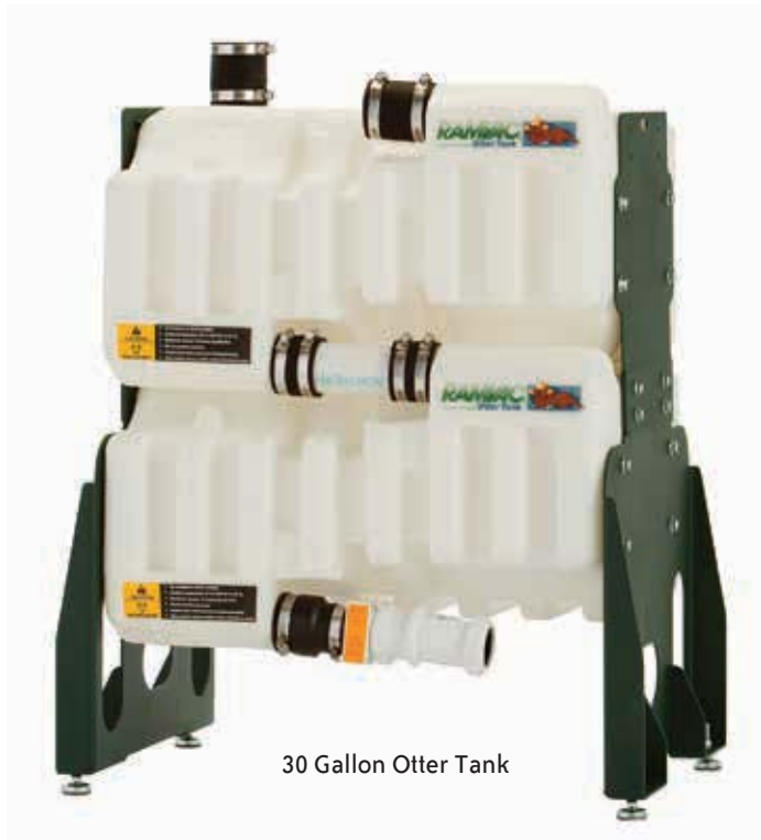
30 Gallon Otter Tank

Tanks store liquids and debris removed from the treatment room. Tanks must be sized to correctly match the volume of liquids and debris you remove during a vacuum operating cycle.