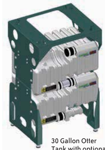
30 Gallon Otter Tank with optional Bison platform (necessary to stack Bison on Otter Tank)