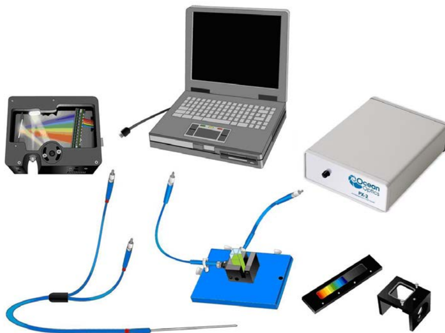
Ocean Optics USB2000+ Fiber Optic Spectrometer Typical Set-up

The USB2000+ Spectrometer connects to a computer via the USB port or serial port. When connected through a USB 2.0 or 1.1, the spectrometer draws power from the host computer, eliminating the need for an external power supply. The USB2000+, like all USB devices, can be controlled by our OceanView software, a Java-based spectroscopy software platform that operates on Windows, Macintosh and Linux operating systems.