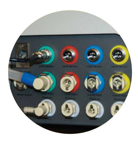
Figure 2. Color-coded inlet connectors. Color-coded inlets with quick connects decrease assembly time and allow the use of multiple buffers and solutions without bottle switching. The level sensors, when connected to the reservoir bottle sensors, detect if bottles are empty or full.