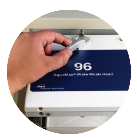
Figure 1. User-interchangeable heads. The user-interchangeable 96 and 384 wash heads can be exchanged and re-attached very quickly to the washer manifold using a simple lever mechanism.