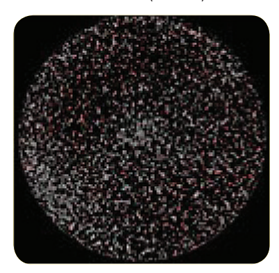
Figure 4. Washing cell-based assays. HEK293 cells were seeded at 10,000 cells/well and incubated overnight. The cells were then labeled with Calcein AM dye and pre-washed to remove most of the dye using the AquaMax 4000 washer with the 96 Well Cell Wash Head. Cells were washed twice with 200 \mu L of wash buffer containing 1X PBS and at 5 mm above plate bottom and imaged. Cells were washed again 3 times with 300 \mu L of wash buffer at 3 mm above plate bottom. Cells were then imaged again to measure post-wash cell area. 95% of cells were retained in wells after washing.