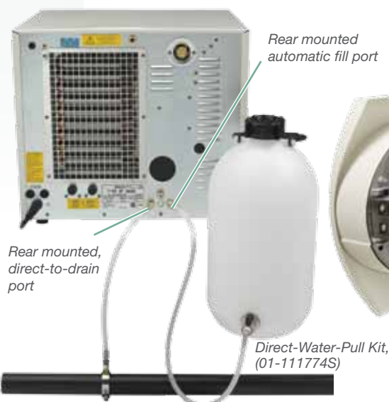
Rear mounted automatic fill port