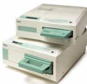
STATIM 2000 and 5000