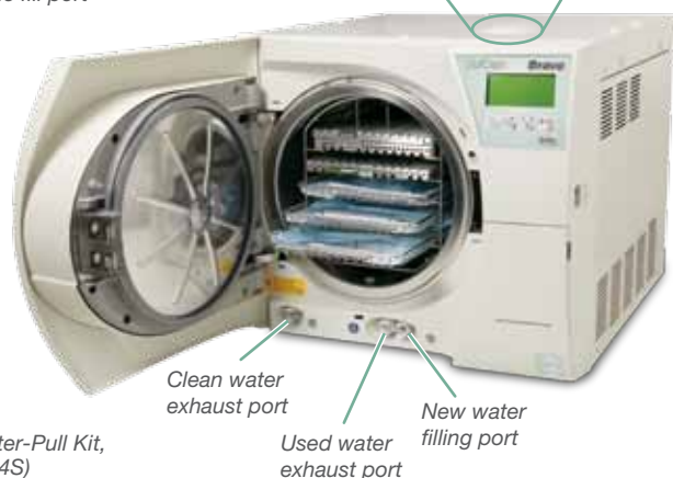
Clean water exhaust port