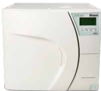
BRAVO™ vacuum autoclave

Faster wrapped and dried. (Our one-word product benefit.)