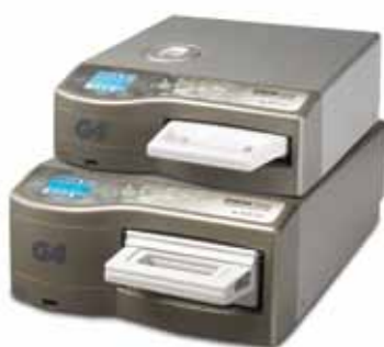
STATIM 2000 and 5000 G4