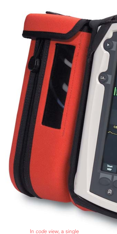
ECG wave is shown in the top half of the screen, the incident timer is larger and alarms are paused.