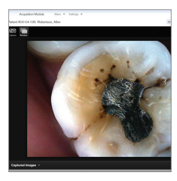
Capture the image through the acquisition interface.

With precise and true-to-life images, the CS 1500 camera not only supports better diagnosis and treatment planning, but also provides the clear visual evidence you need to show patients exactly what you see. The camera's sharp, detailed images drive better conversations, which in turn, help patients make smarter, more informed decisions about their options—so they're more likely to accept treatment.