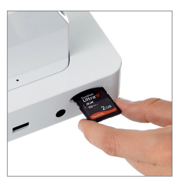
Save the image to your computer or SD card.