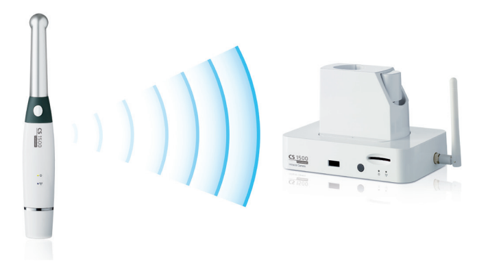
Built-in digital Wi-Fi for reliable and fast image acquisition—no wire required.

Available in both wireless and wired versions, the CS 1500 camera's wireless configuration features state-ofthe-art Wi-Fi technology to ensure the most flexible and mobile solutions for your imaging needs. Offering faster transmission times, more stability, and less noise than analog wireless devices, the CS 1500 camera provides maximum reliability, while delivering the same image quality as the traditional wired version.