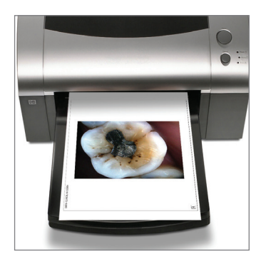
Print the image on any kind of printer.