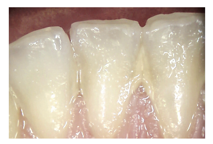
High-resolution images reveal even the tiniest details.