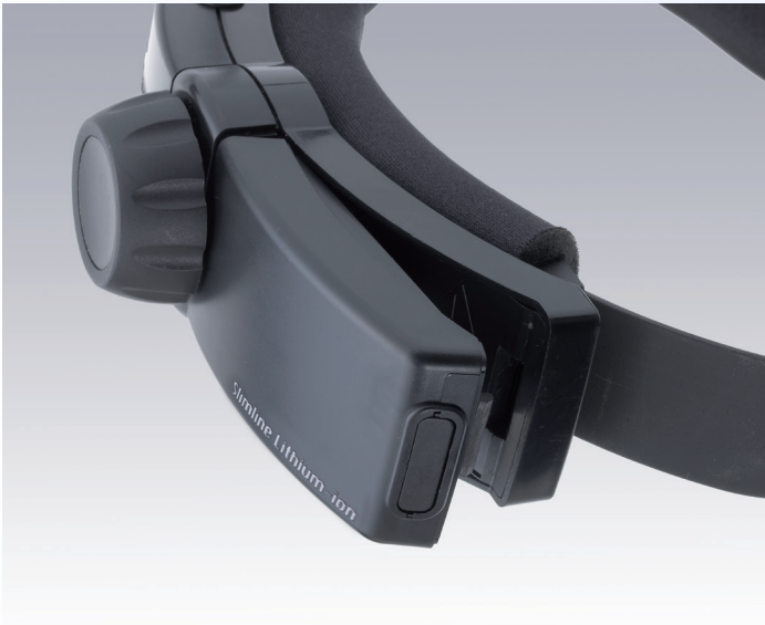
Slimline Lithium Polymer Battery