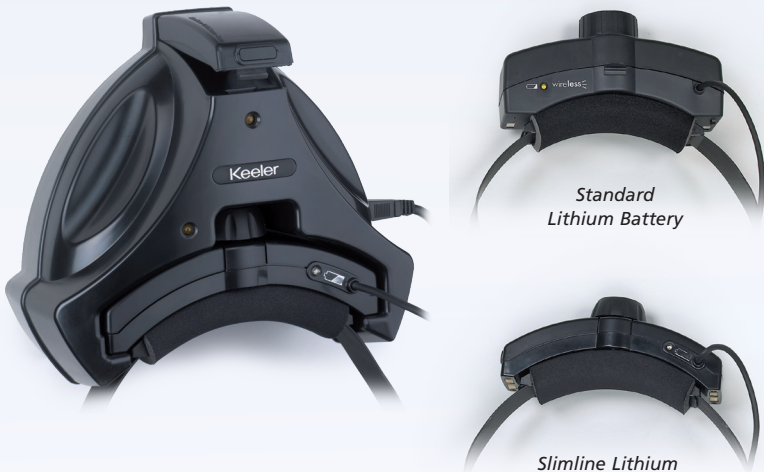
Slimline Wireless Charger

The new wall mountable charger remains as durable as the Standard Wireless battery charger with the facility to store your extra battery in the top compartment. The charger has an easy release button to remove your extra battery.