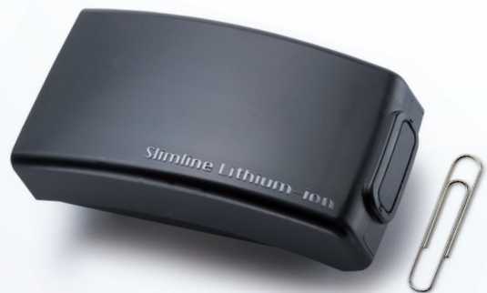
Slimline Lithium Polymer Battery (paper clip shows scale)

Keeler wireless technology allows you to move from room to room without any constraints. The chargers are either desktop or wall mountable and store an extra lithium battery as a back up, should you need it.